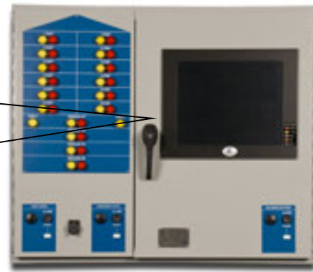
Guard Level 01324 MCU

Very compact main control panel for cargo level, temperatures, tank pressure and if supplied all other ballast and service tank levels. Main panel incorporates independent 98% level alarm (shown) Power fail alarm for both mains and auxiliary power sources are provided. Serial RS422/485 and Ethernet ports are provided as well. Complies with IMO, USCG and Class requirements for closed loading and incorporates intrinsically safe sensor inputs/outputs. Required power: Recommended 24VDC from Bergan Guard Power® UPS supply.